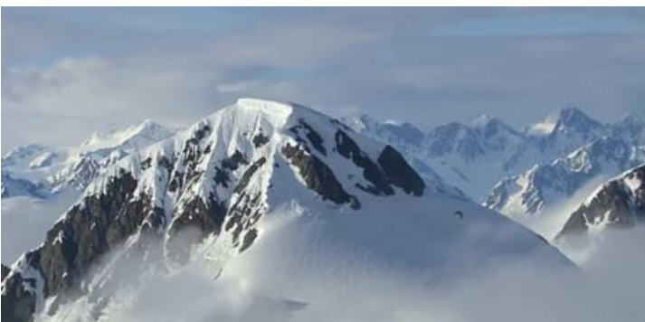
ALASKA'S GLACIERS AWAIT: LAST VESTIGE OF THE ICE AGE.

And this will be in perfect season—for the Rocky Mountains, which will be bathed in summer sunshine, and for viewing the Alaskan wildlife. The riches of Alaska will pass before your eyes as you cruise the Inside Passage aboard the world's most luxurious cruise ship, the all-suite, all-balcony, six-star Regent Seven Seas Explorer. She will take you in impeccable style on an exciting journey from Vancouver to Seward, amid breathtaking sights.