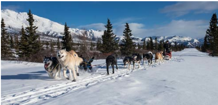
TAKE A HELICOPTER FLIGHT—AND GO DOG SLEDDING.

Most are free of charge—and even the fantastic additional excursions including helicopter and sea plane flights are extremely affordable—particularly when you factor-in your exclusive Club savings. And of course, all that you require aboard Mariner is generously, no-holds-barred free of charge.