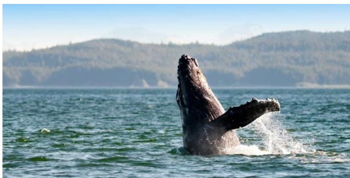
HUMPBACK: ONE OF THE MANY WHALE SPECIES ON VIEW.

And this is the way to see them: travelling in supreme comfort and luxury, Champagne at hand, on a six-star cruise with Regent Seven Seas and including, for our Members, one of the world's great rail journeys, the Rocky Mountaineer in summer. This is a luxurious holiday, with helicopters and sea planes laid on so you can take to the air to witness the glories of the glaciers and the wildlife. It will ensure that nothing is allowed to get in the way of your unadulterated pleasure in the sights, sounds and sheer joys of Nature at its most wild and free—close up, and in total comfort.