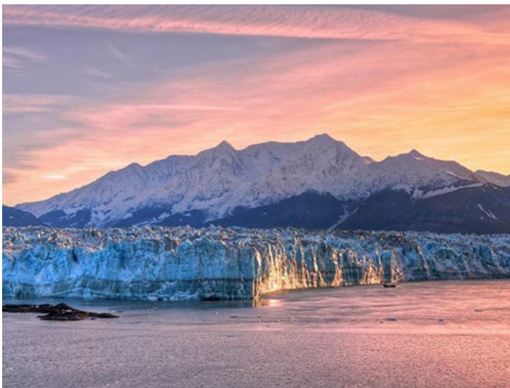
MENDENHALL GLACIER, ONE OF THE GREAT ALASKAN SIGHTS.

You have exclusive advantageous Club rates on all Regent Seven Seas Cruises, and this is one we find irresistible. The dates are July 21 to August 3, 2023. This all-inclusive 13-night holiday was featured in the latest CountryClub Magazine—and now only eight places remain. So please read on—and enjoy!