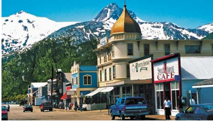
COLOURFUL HISTORY: SKAGWAY, GOLD RUSH TOWN..

In such isolated, spectacular locations, where there is so much to see and do that it will take your breath away, the 44 shore excursions really come into their own. At each port of call you can take as many excursions as you wish—and have energy for!—among the variety of adventures, sheer luxury and discovery.