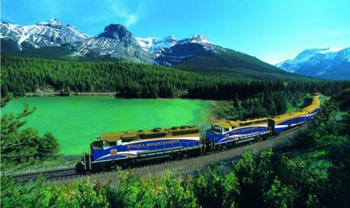
THE ROCKY MOUNTAINEER, ONE OF THE WORLD'S GREAT TRAIN JOURNEYS

Now is definitely the time to go. Alaska really is one of the last unspoiled regions on earth—but the changing climate is making it also one of the most threatened places on earth.